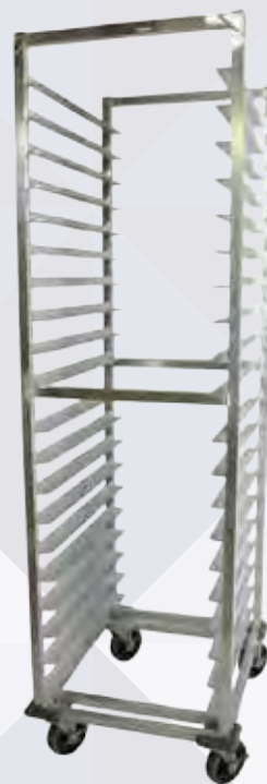
WE3018INST (shown with optional BUMP414)