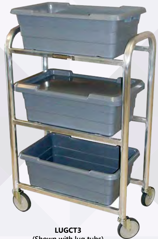
LUGCT3 (Shown with lug tubs)