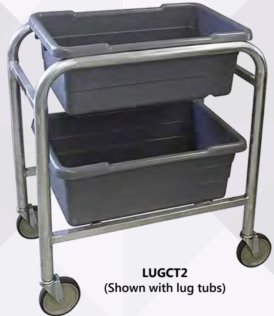
LUGCT2 (Shown with lug tubs)