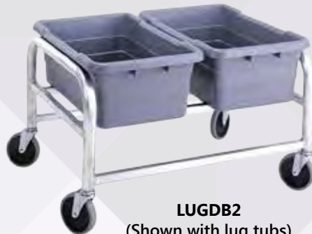
LUGDB2 (Shown with lug tubs)