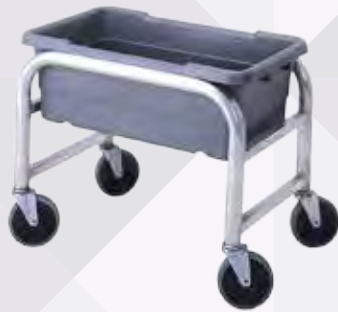
LUGCT1 (Shown with lug tubs)