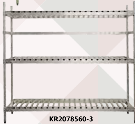
KR2078560-3 (shown with optional U-Frame)