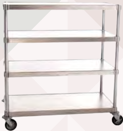
N244860-4-CHL2-B4 (shown with optional bumpers)